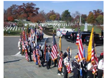
Above: Veterans organizations awaiting start of Arlington Cemetery program.