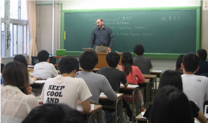
Lecture at Keio University, June 10, 2015.

In June 2015, I participated in a Japan residency sponsored by the Organization of American Historians and Japanese Association for American Studies (JAAS), during which I spent two weeks lecturing at Tokyo's Waseda University, an elite Japanese institution of higher education. It was a unique opportunity for me to present research on Japanese Americans to scholars in Japan. They were fascinated in particular to learn about ethnic Japanese in the Americas, about whose history many were largely unaware.