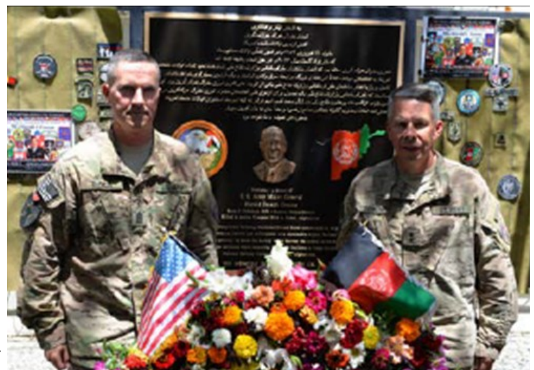
August 5, 2015 dedication of the MG Harold J. Greene Memorial plaque.