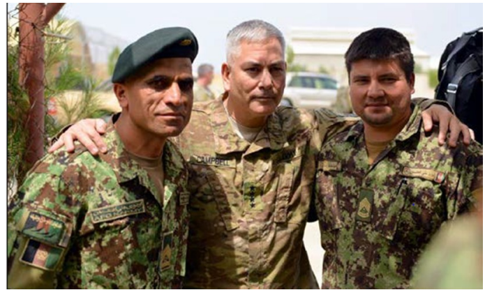
General Campbell (center) with senior Afghan National Army NCOs during Kunduz visit.

I took several key members of my staff as well as a BBC TV crew for a battlefield circulation visit to Kunduz province, one of the northern provinces. It was a productive visit, as I had the opportunity to hear firsthand from Afghan civic and military leaders about the challenges in that area. [I met] with Abdul Rab Rasul Sayyaf, a highly respected Afghan religious leader and Mujahideen commander who fought against the Soviets. Also on July 4th, I was extremely disappointed to learn Acting Defense Minister Stanekzai was not confirmed by Parliament. I continue to be very impressed by his leadership and I can honestly say I've seen him do more in the past three months for MoD than previous ministers have done over a period of years. He remains in place as the Acting Minister of Defense, even against threats against his own life as well as his family. I was proud to have an opportunity to meet with a group of young Afghan Advisory Board members. This month's guests (6 total) included Afghan government officials, commercial media, an economist, and a civil rights leader. I appreciate the insight they provided.