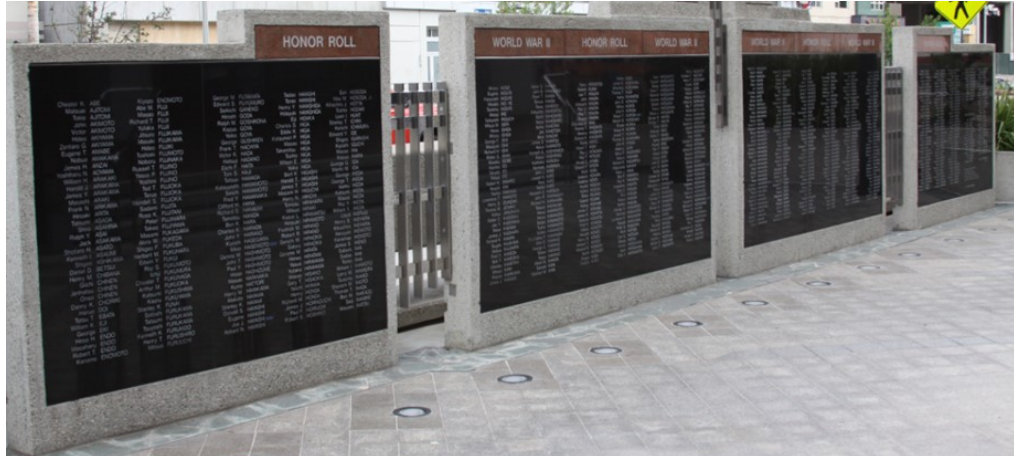
A portion of the Japanese American National War Memorial Court which lists the names of all Nikkei who were killed in combat situations from the Spanish American War of 1898 to the present.

Through the tireless effort of the Japanese American Korean War Veterans, in May 1997, the names of 251 Japanese Americans killed in the Korean War were added to the Memorial Court Wall.