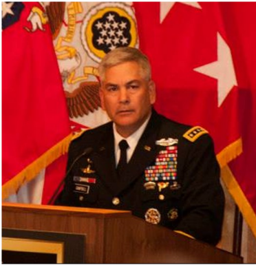
GEN John F. Campbell, USA

[Editor's Note. General John F. Campbell, USA, Commander of the international Security Assistance Forces/US Forces-Afghanistan, or otherwise known as the Resolute Support Command (RSC) sends a newsletter periodically to members of his command, their families, and others on his distro. He provides his perspective of the issues and how his Command is coping with them. We thank GEN Campbell for his insights and for taking the time to keep us informed. The following are excerpts from his August & September 2015 Newsletter.]